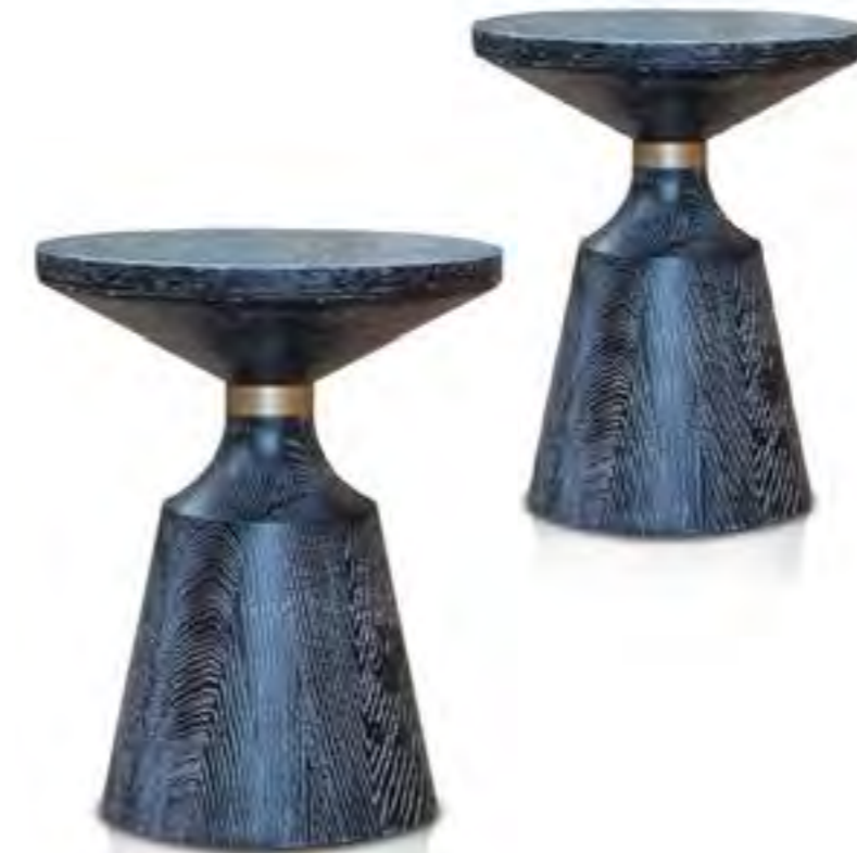
BOMBETTA coffee table https://architema.it/prodotto/bombetta/