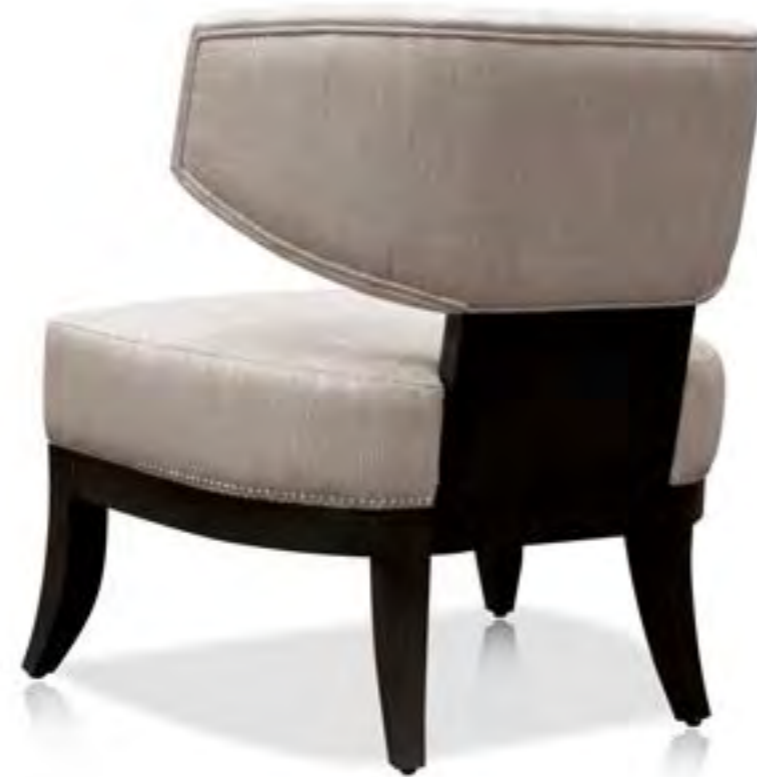
TRASGIO armchair is also available with plain back https://architema.it/prodotto/trasgio/