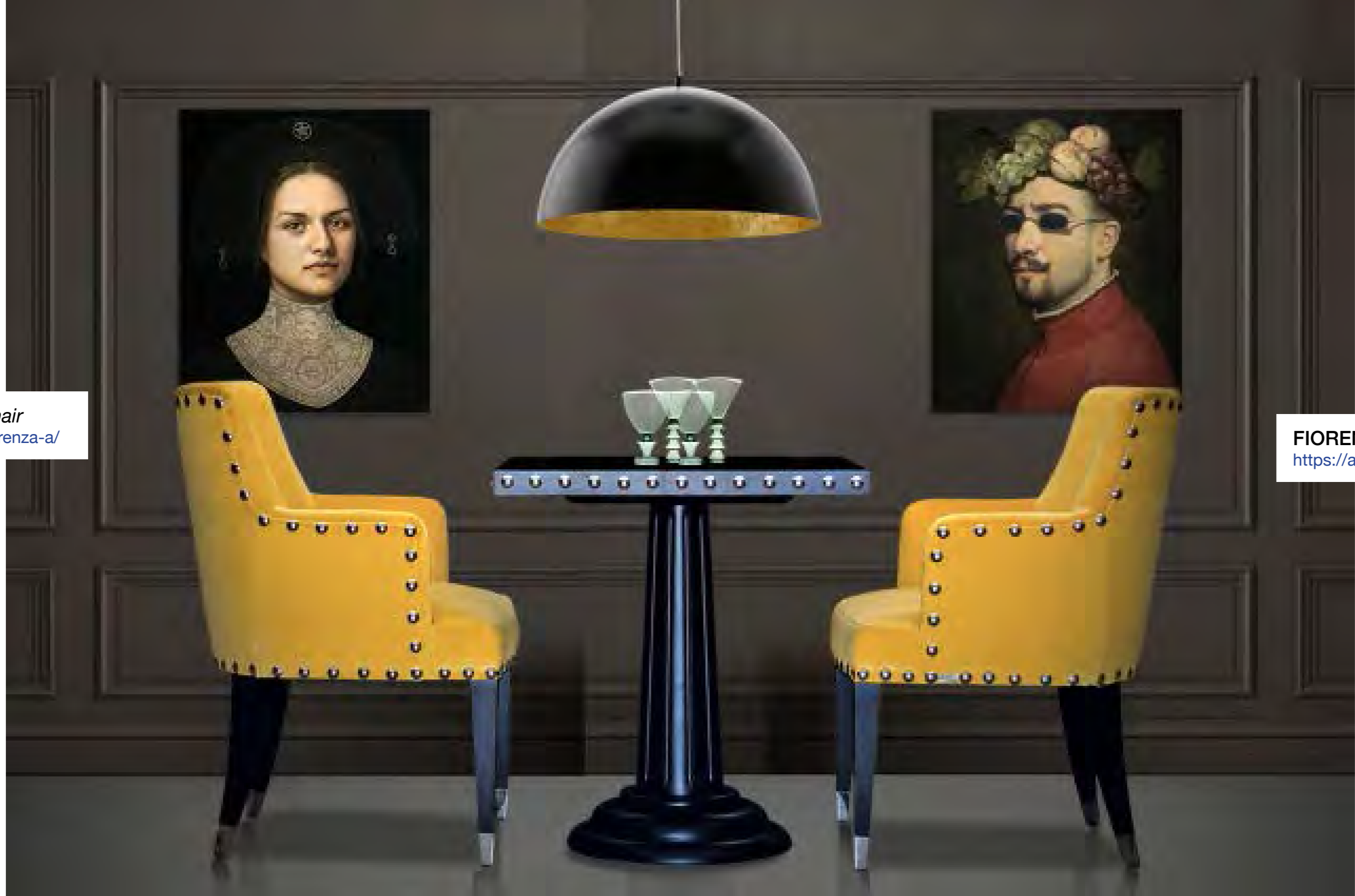
FIorenza TV dining table https://architema.it/prodotto/fiorenza-tv/