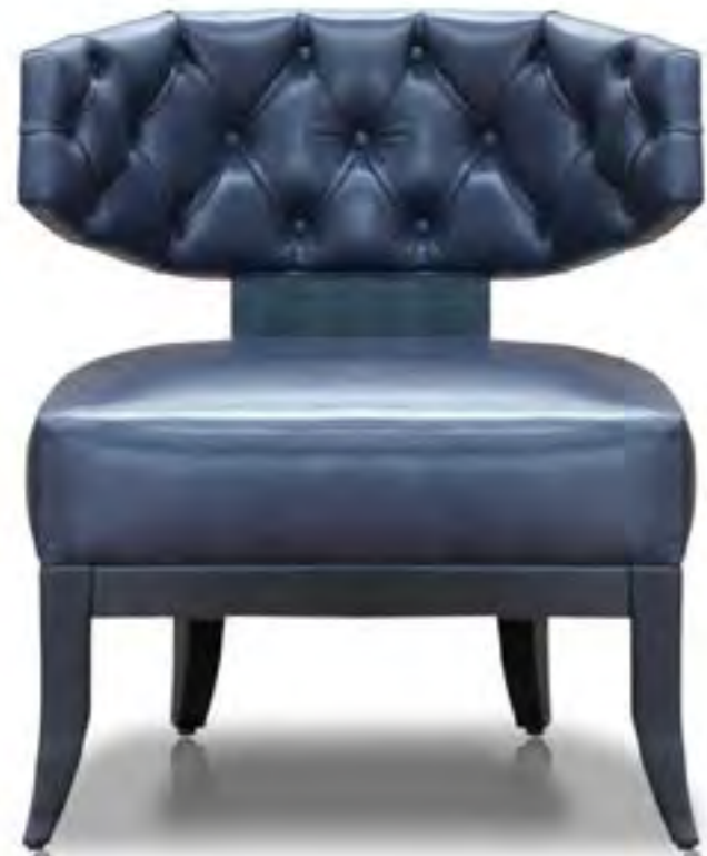
TRASGIOCAP armchair https://architema.it/prodotto/trasgiocap/

https://architema.it/prodotto/sky-princess-cruise-ship-project/