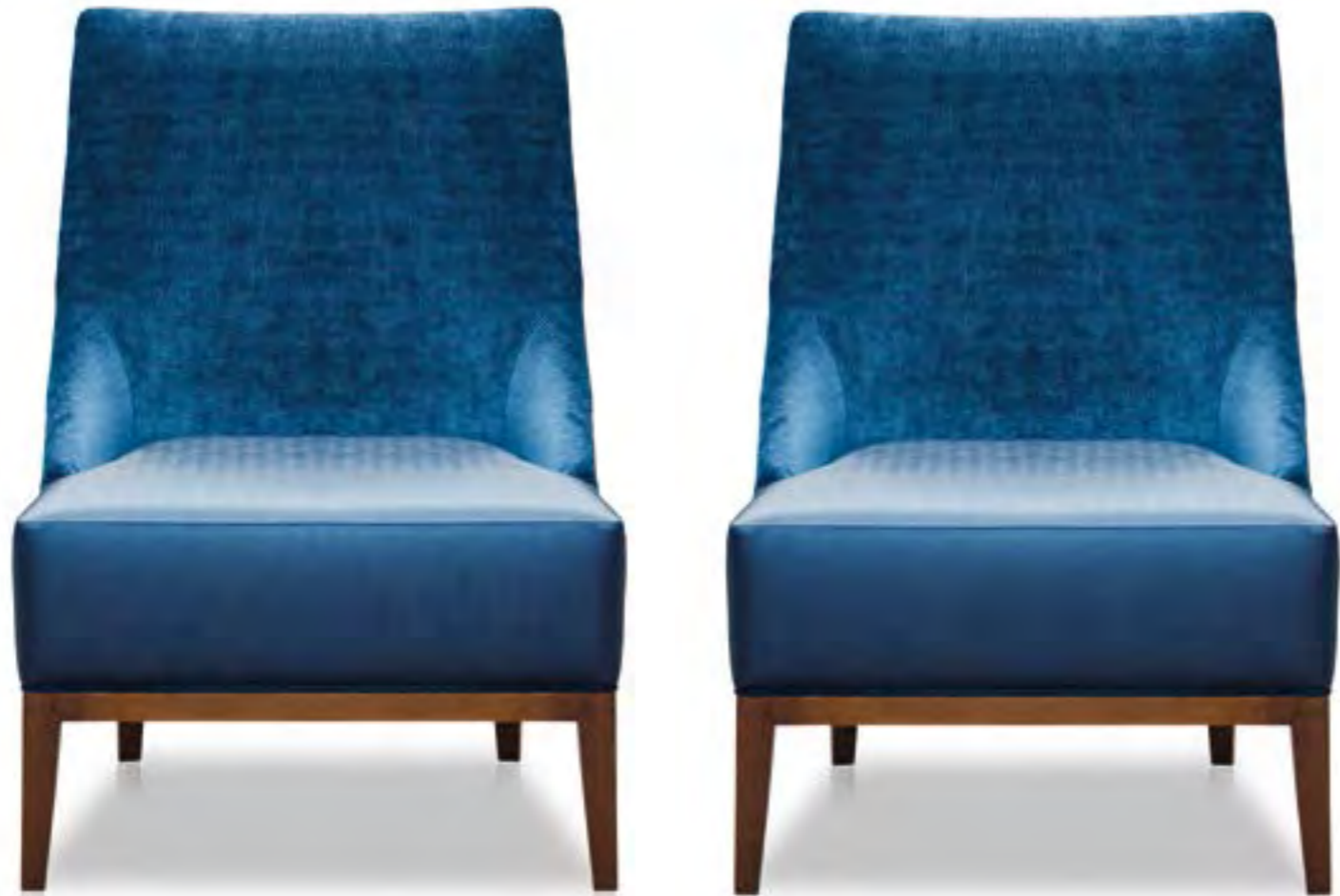
ULLALLA armchair https://architema.it/prodotto/ullalla/